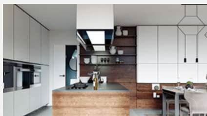
Final 2021 KBMI Survey Reveals Impressive Industry Resilience